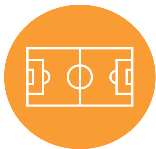
Well Designed Playgrounds