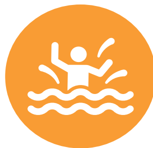
Covered Hygienic Swimming Pool