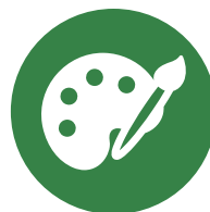
Drawing & Painting