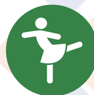
DANCE (Classical, Folk & Contemporary)