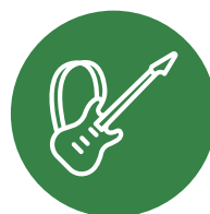
MUSIC (Vocal & Instrumental)