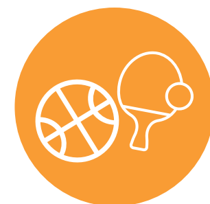
Large Indoor Sports Hall (Badminton, Basket Ball, Table Tennis)