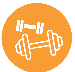
Well Equipped Gym Area for Boys and Girls